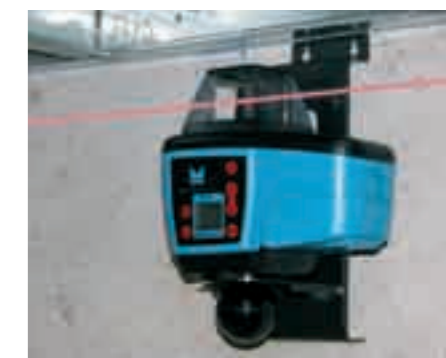
Wall-mount when installing ceiling grids