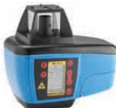
Mikrofyn Multipurpose Laser ML13x/4: