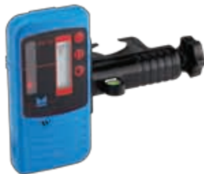
Mikrofyn HS10 handheld receiver