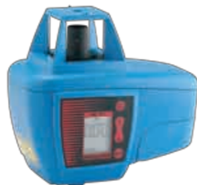
Mikrofyn Multipurpose Laser ML11x: