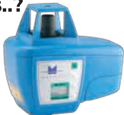
Mikrofyn Multipurpose Laser ML10x: