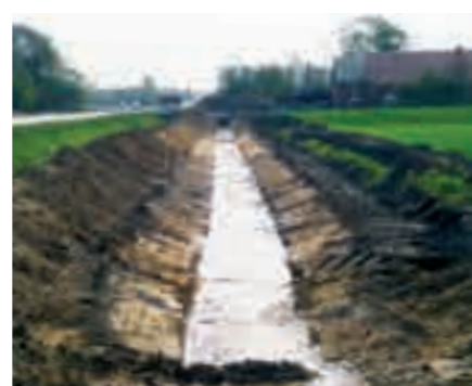
Drainage works and sloping surfaces