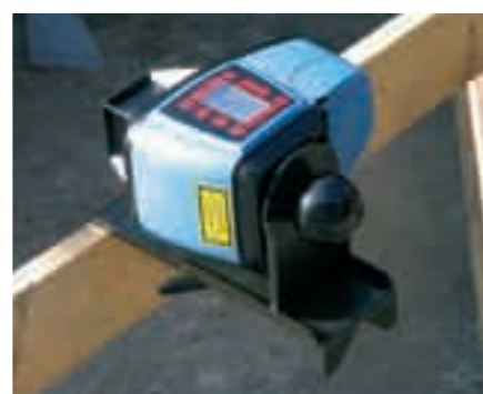
Laser mounted on a batter board