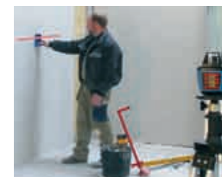
Scan function using "search-and-scan"