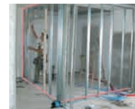
Scan function using "search-and-scan"

Position the laser over the reference point - walk up to the other end of the factory hall and place the HS14 combined receiver and remote control over the other reference point - press one button and the laser automatically aligns itself. A very practical function if you are alone and 6m up a scaffold. Works both in horizontal and vertical mode.