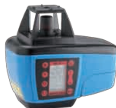
Mikrofyn Multipurpose Laser ML14:

The HS14 is in essence labor saving. It will enable you to remotely access all laser functions across the entire work site. Eight selectable radio channels will ensure undisturbed functionality on a crowded worksite.