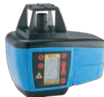
Mikrofyn Multipurpose Laser ML13x: