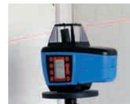
Dual slope and visible beam