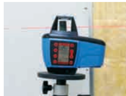
Self leveling laser function