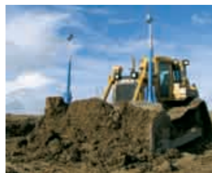
Machine control for dozers, graders, excavators etc.