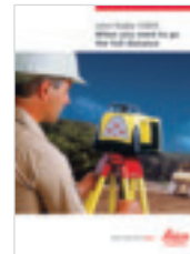
Leica Rugby 100LR The long range construction laser