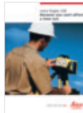
Leica Rugby 100 The tough construction laser