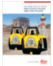
Rugby 300SG/400DG Single and dual grade construction lasers