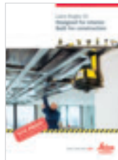
Leica Rugby 55 The multipurpose construction laser

R50 (Art. No.:753672): Laser class 1 in accordance with IEC 60825-1 and EN 60825-1